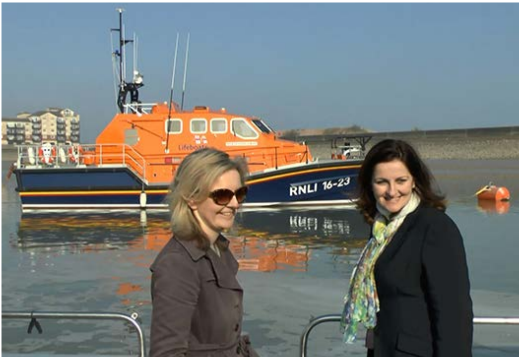
Liz Truss MP and Caroline Ansell MP at Sovereign Harbour

The purpose of the meeting, which had been arranged by Mrs Ansell, was to discuss the injustice of the Marina Rent Charge that all Sovereign Harbour property owners are obliged to pay, and to the failure of the Environment Agency (EA) to respond to legal evidence provided to it, showing it had no authority to collect the charge.