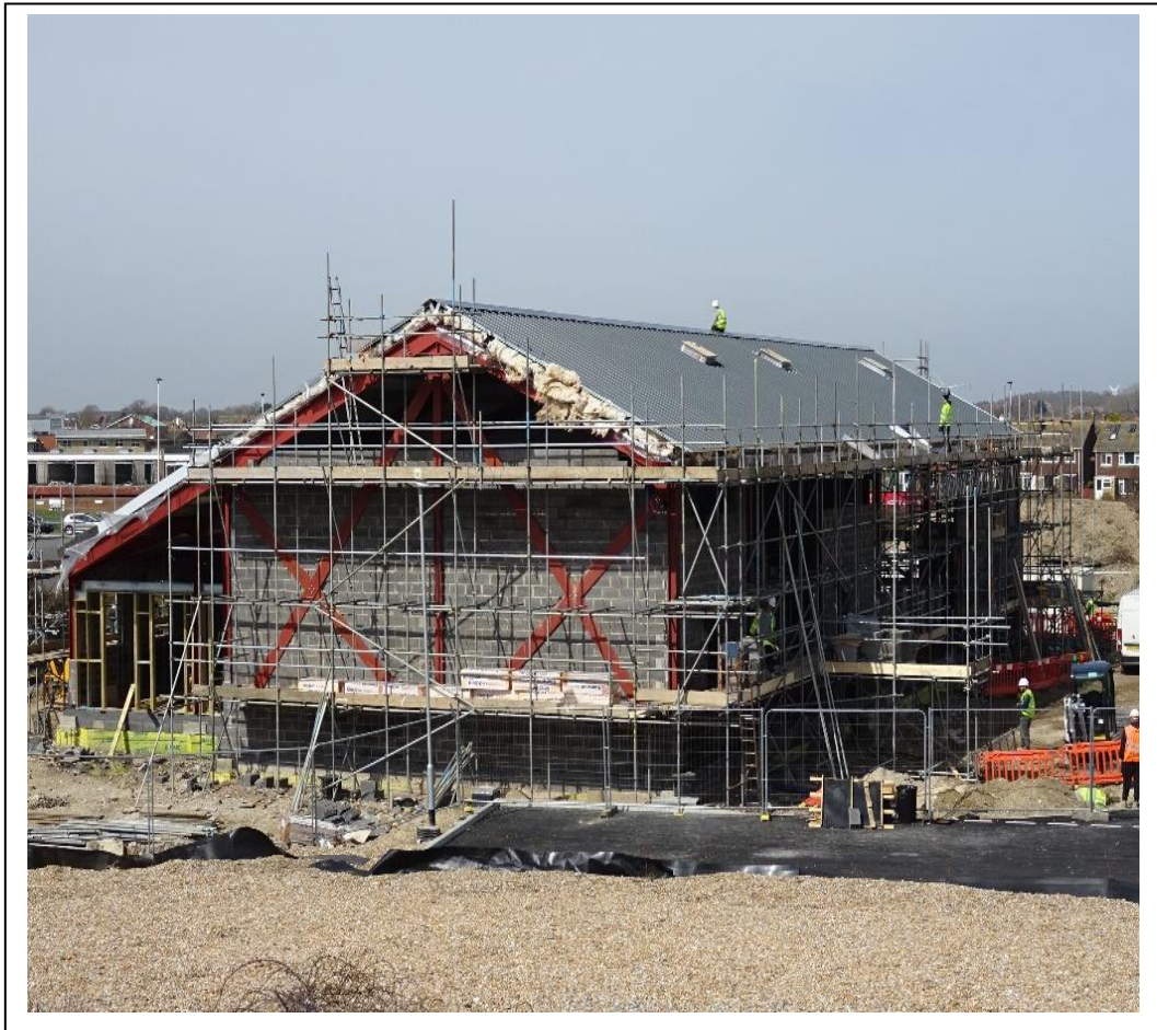
External works continuing to the walls. The windows and doors are due on site next week.